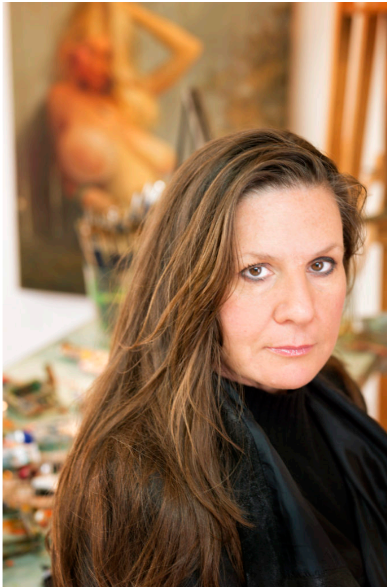
Lisa Yuskavage.