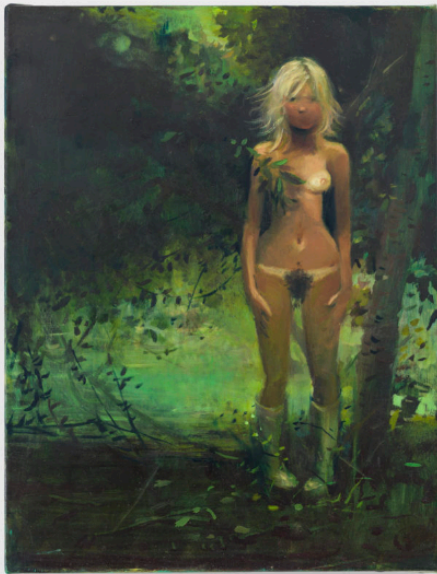
Lisa Yuskavage, The Deer (2014).