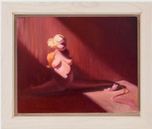
Lisa Yuskavage, Split (1997).