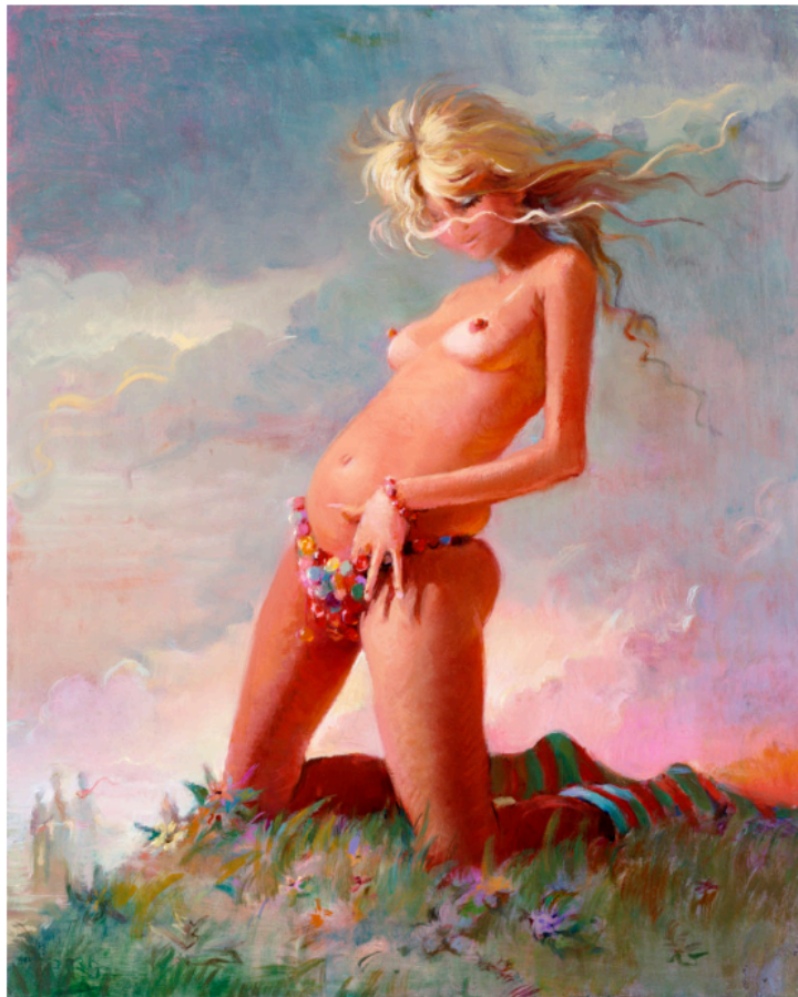
Lisa Yuskavage, Half-Family (2003).

See works from the artist's upcoming Zwirner exhibitions below.