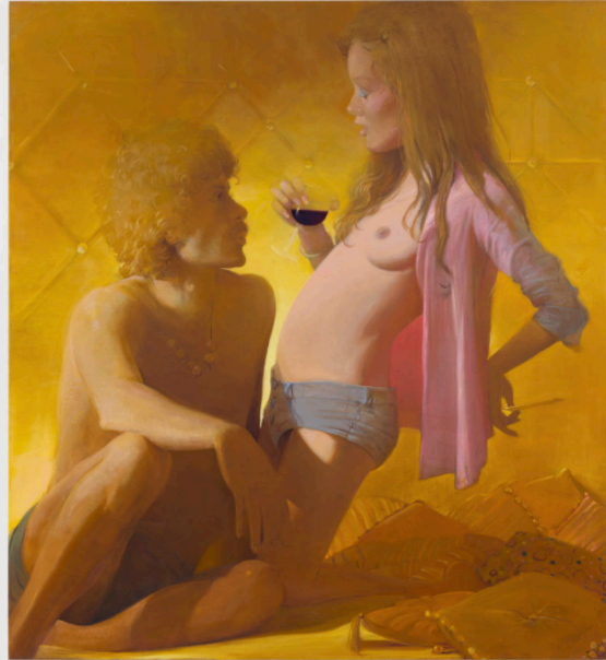
Lisa Yuskavage, Golden Couple (2017).