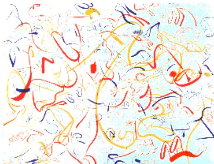
Sue Williams , American, B. 1954 Shower Cap in Red, Blue and Green , 1998 Oil and acrylic on canvas