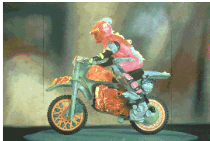
Richard Patterson , British, b. 1963 Motocrosser , 1994 Oil and acrylic on canvas