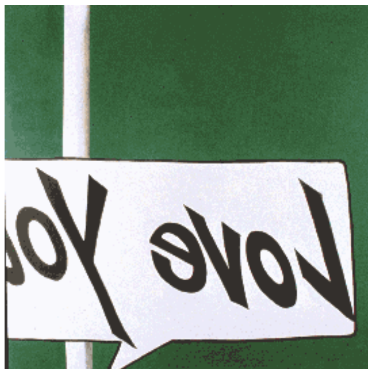
Rochelle Feinstein , American, b. 1947 Love Your Work #3 , 1999 Oil on canvas

The artists in Negotiating Small Truths share a common philosophical approach to painting that raises fundamental questions about truth and believability. Using widely differing techniques and a mixture of both abstract and representational imagery, they create works that challenge past assumptions