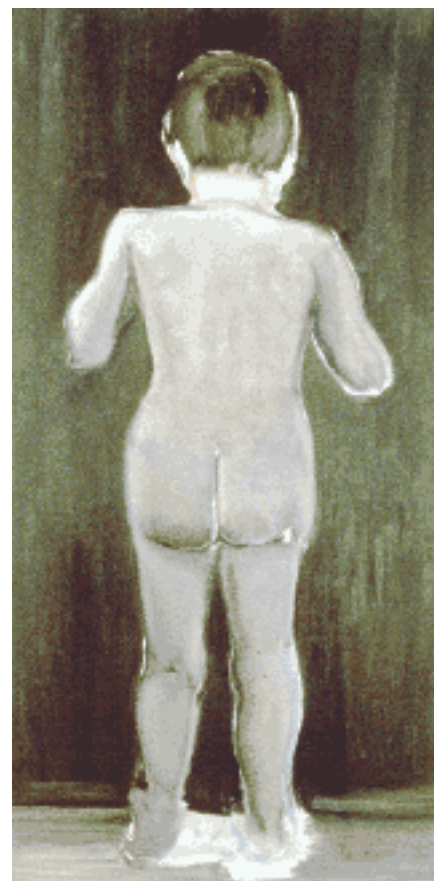
Marlene Dumas , South African/Dutch, b. 1953 The Secret , 1994 Oil on canvas